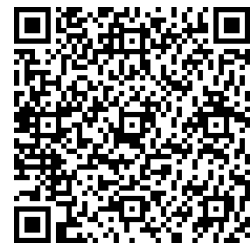
AC Override OFF